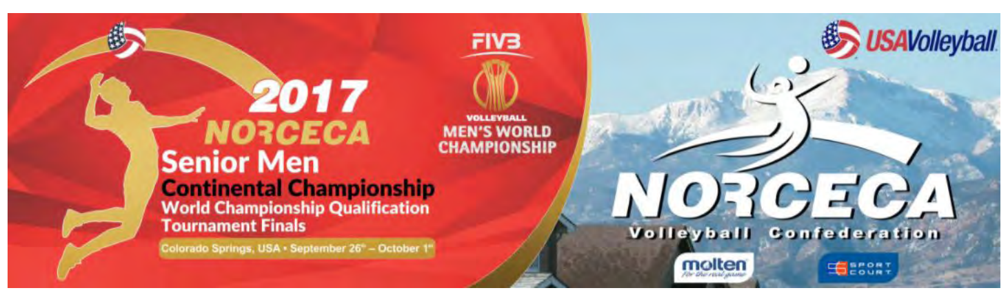
Daily Bulletin #1 * Boletin Dairio | September 25, 2017 * 25 de Septiembre de 2017